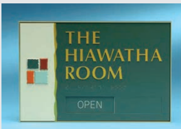
Sign framed with Aluminum Series 100 Frame

A framed sign presents a win-win scenario for both sign makers and customers. Customers save money in the long-run by using frames. Those savings off-set the higher initial price of the job. For the sign maker, frames add another source of profit and a greater likelihood of long-term customer satisfaction and follow-on business.