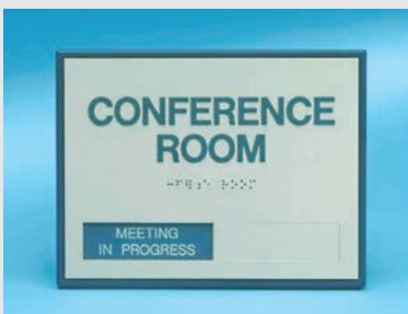
Sign framed with Injection-Molded Styrene Modular Frame

This article was originally published in Messages, the newsletter of SEG D, the Society for Environmental Graphic Design. Learn more about SEG D and environmental graphic design at www.segd.org .